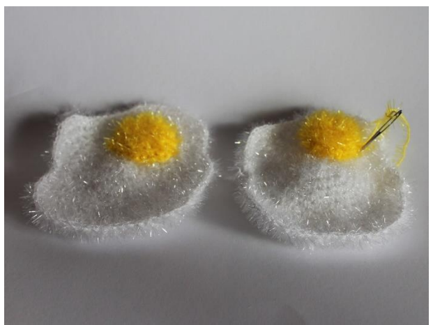
I hope you have fun to crochet this and much more fun to clean with it...